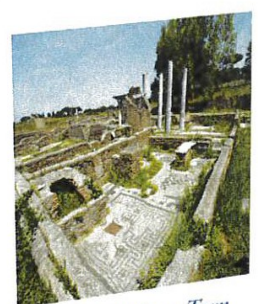
Another Wrong Turn on Carillon Avenue

Media, Examination, and Review Copies: Contact: Shanalea Forrest (541) 344-1528, ext 151 or shanalea@wipfandstock.com